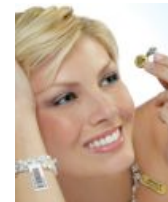
Arch Crown, Inc.